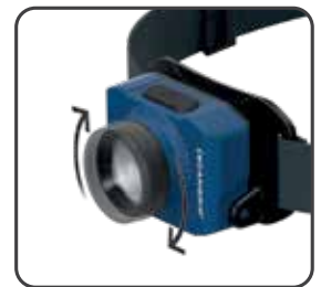
Adjustable beam angle 10°-60°